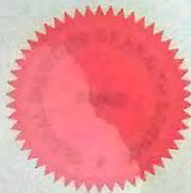
Registrar / Director